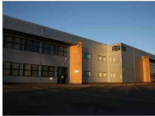
GPT St. Neots, UK