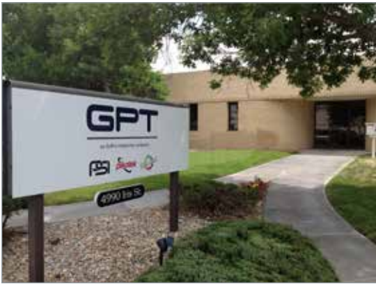
GPT Wheat Ridge, Colorado

At GPT we are committed to manufacturing and supplying only reliable, high-quality products that exceed our customers' requirements and expectations.