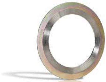
KAMMPROFILE Metallic Gasket Serrations concentrate bolt load on small area for a tight seal at lower stress. Kammprofile's solid metal core resists cold flow, overcompression and blowout. The rigid core provides exceptional stability, even in large sizes, and facilitates handling and installation.