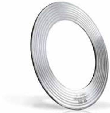
GRAPHONIC® Spiral Wound Gasket Corrugated metal core encapsulated by soft sealing elements. Excellent for high temperatures and corrosive chemicals. Works well in less-than-perfect flanges and thermocycling applications.