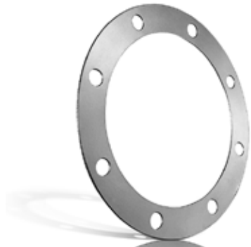
GRAPH-LOCK® Style 3128 HOCKDRUCK® High performance multi-layer graphite with 316SS inserts provides high compressive strength, blow-out resistance, excellent handling properties and improved tightness.